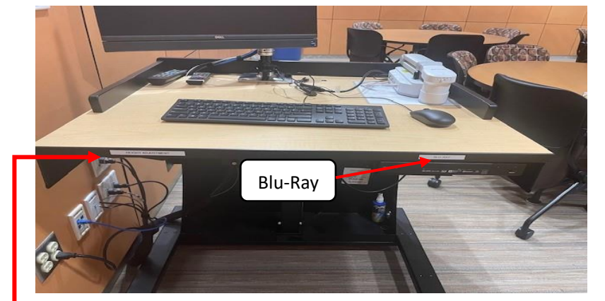
To adjust the height of the console, grasp the adjustment handle and squeeze towards you to release the mechanism. You can then raise or lower the console to desired height.

If you require any software or hardware that is not installed in this classroom, please contact your office manager.