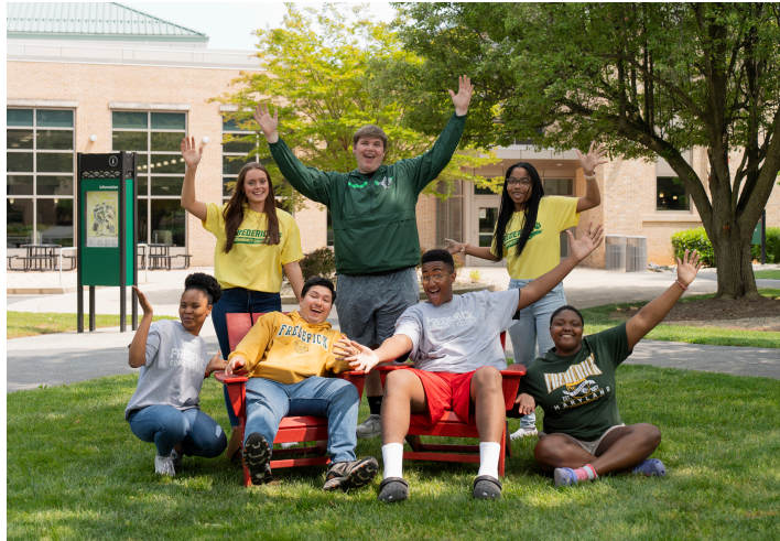
Catalog effective Summer 2024 through Spring 2025

Frederick Community College 2024-2025 Academic Catalog, produced by the curriculum systems & scheduling office, April 2024.