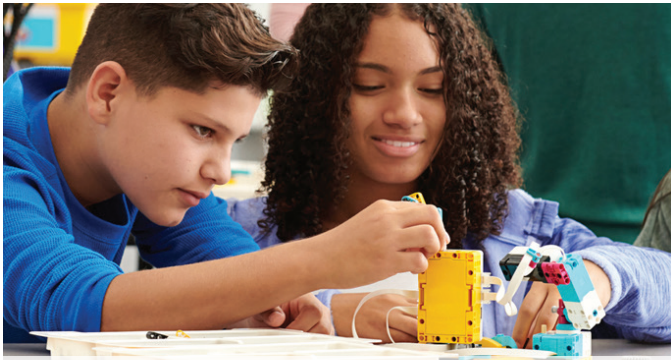
Copyright LEGO Group. This is an independent publication not authorized or sponsored by the LEGO Group.

Enjoy a classic experience in a fun and safe environment. Get a jump-start on high school band and plan for a successful concert season.