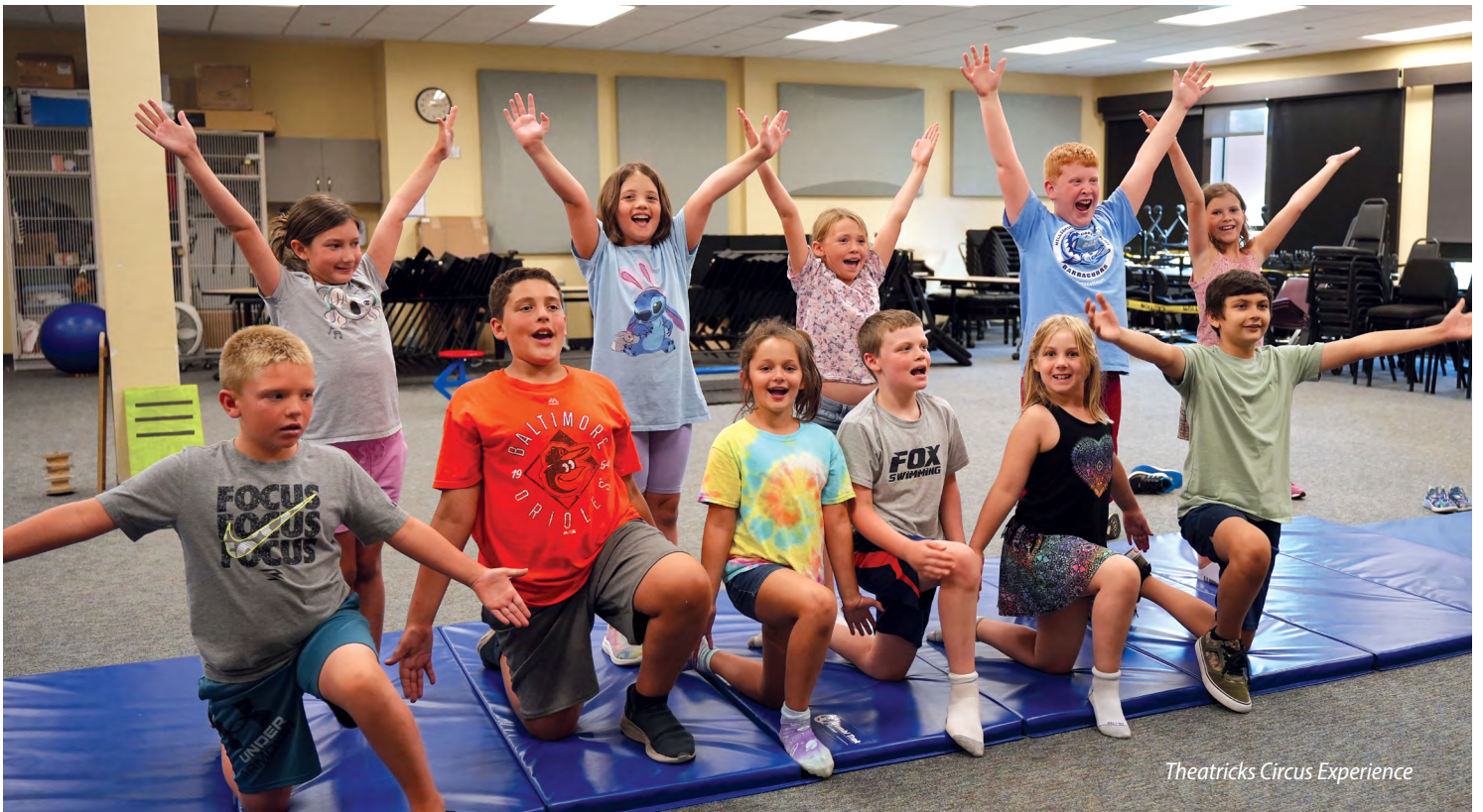
Theatricks Circus Experience